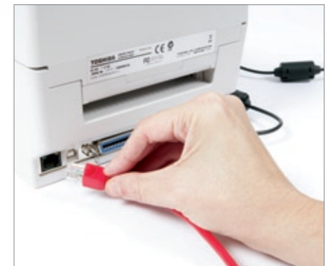
Built-in networking as standard with a 10/100Mbps LAN interface