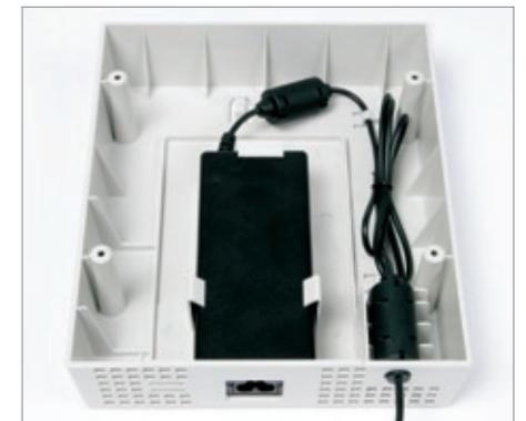
An optional power supply tray for retail installations