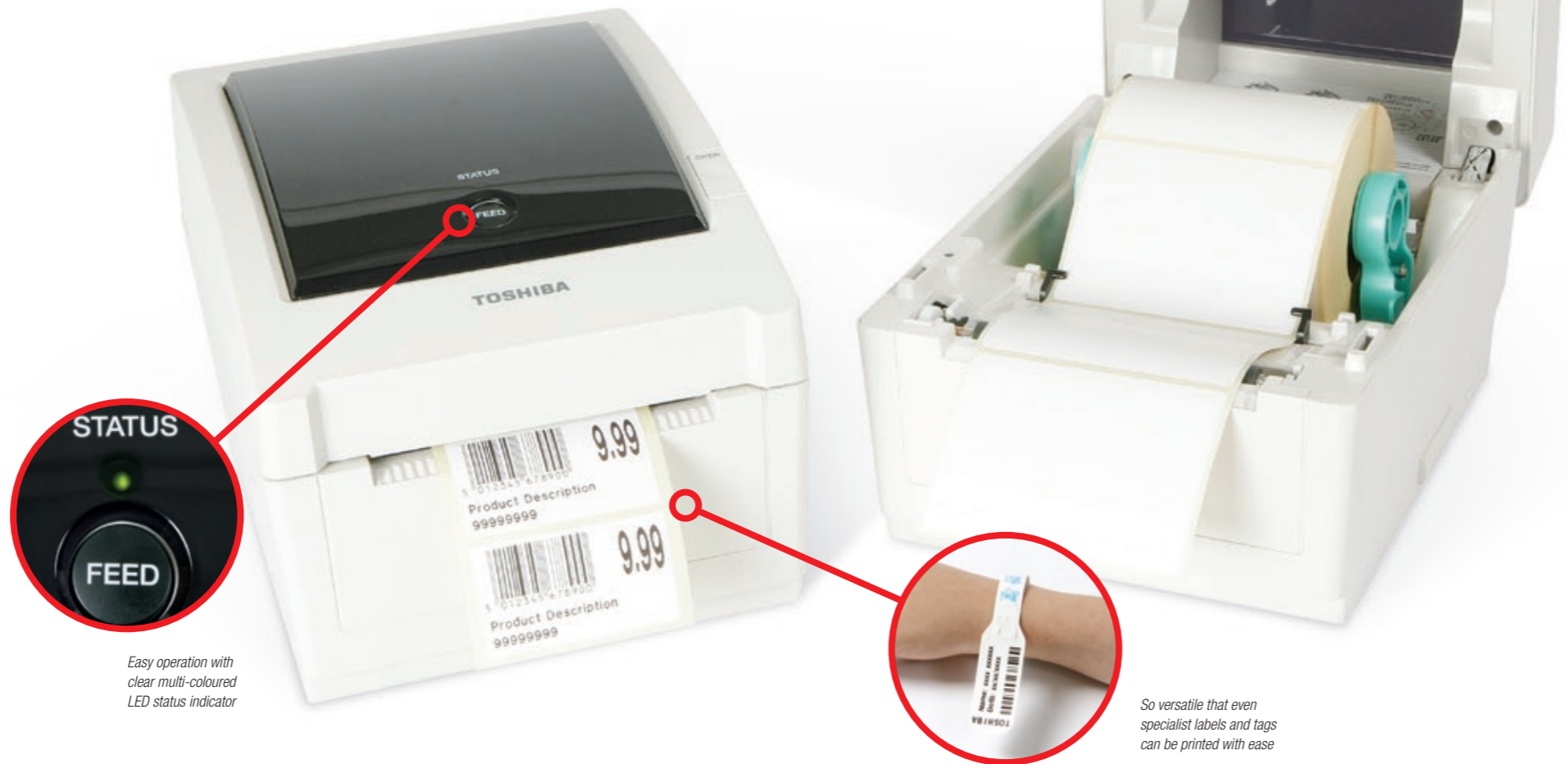
Easy operation with clear multi-coloured LED status indicator