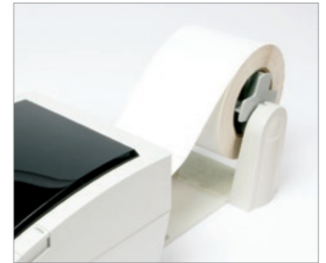
A wide range of options, including an external media stand